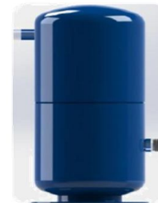
E - TYPE